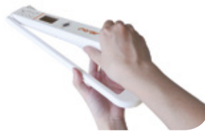
Unfold to use