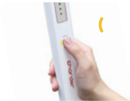
G-sensor tilt indicator ensures accuracy