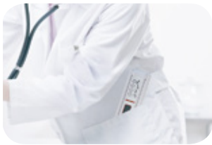
Compact size, easy to carry