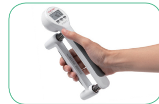
Multiple measurement modes

The dynamometer can be adjusted to different levels of resistance for different individuals. Three modes are available, measuring maximum grip strength, average grip strength, or number of repetitions that meet the selected minimum grip force.