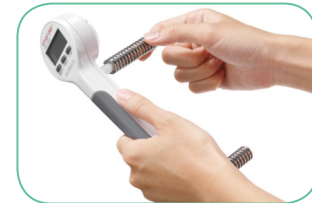
Multiple spring options